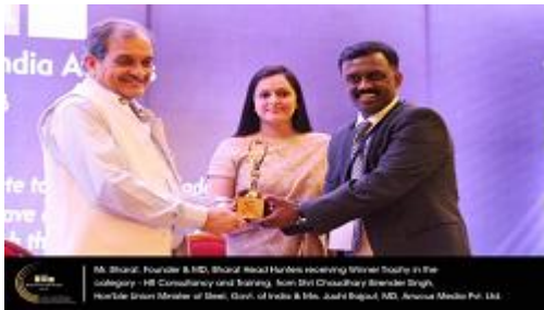
SME Award 2018, New Delhi