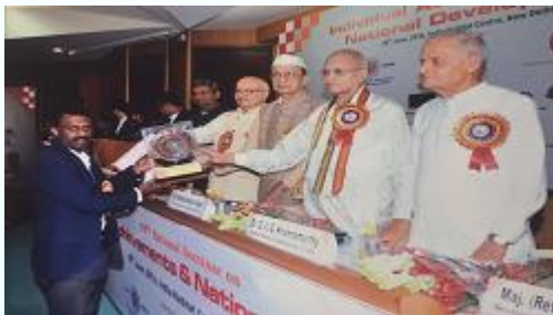
Indian Leadership Award